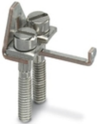
Switching jumper, pitch: 8.2 mm, number of positions: 2, color: silver

Please be informed that the data shown in this PDF Document is generated from our Online Catalog. Please find the complete data in the user's documentation. Our General Terms of Use for Downloads are valid ( http://phoenixcontact.com/download )